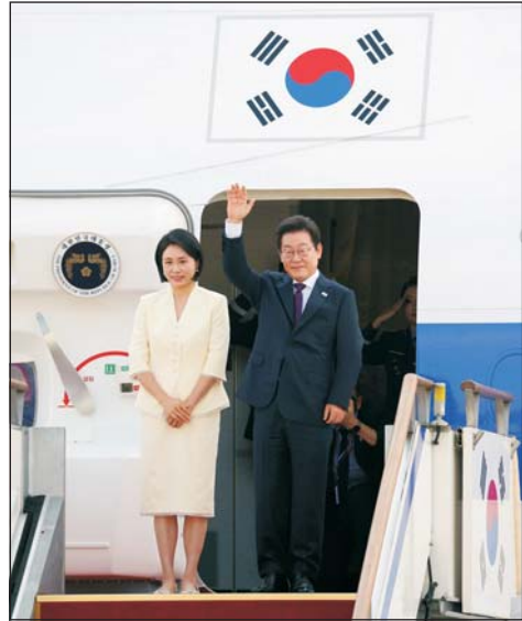
President Lee leaves for Japan, Seoul Air Base, on a key diplomatic trip for high-stakes summits with Donald Trump and Shigeru Ishiba.

In 1982, Lee's fortunes started to turn when he gained admission into Chung-Ang University in Seoul, where he studied law on a full scholarship. He took the bar examination in 1986 and achieved a passing score. For almost two decades that would follow, he focused his law practice in the areas of human rights and labor policy. Drawing on his own experience, he advocated for the rights of the underdogs such as those being evicted from their apartments because the apartments were being redeveloped or people injured at an industrial job.