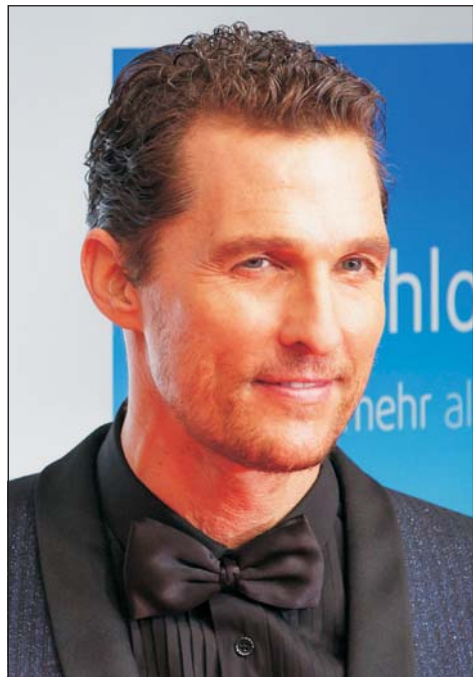
Matthew McConaughey attending the Goldene Kamera Awards in Berlin, Germany in 2014.