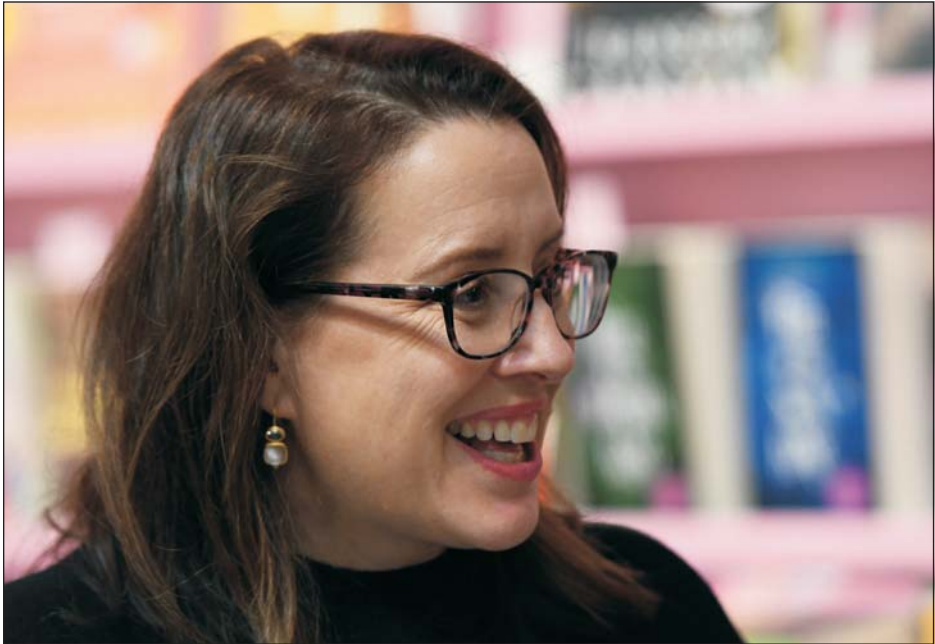
Julia Quinn at the Göteborg Book Fair 2025.

Julia Quinn is the pen name for American author Julie Pottinger. She is a romance author, specializing in historical romances set in Regency-era England. Quinn began her literary career while a student at Harvard University, starting her first novel in the summer before her senior year and finishing it after her graduation in 1992. Her first novel, Splendid , was published in 1995. After a brief stint at the Yale School of Medicine, Quinn decided to drop out of medical school to pursue being an author full-time. At that point, she had already published the rest of the Splendid trilogy, as well as the first book in the