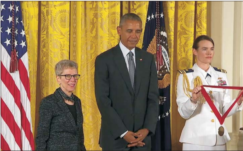
Terry Gross, about to be awarded the National Humanities Medal by President Obama at the White House. Screen capture of a video marked "public domain" by the White House, via Wikimedia Commons.