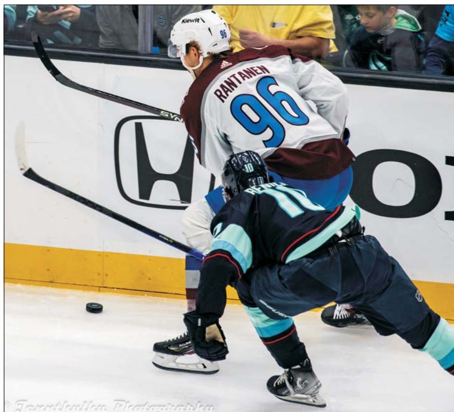
Round one game four of the Stanley Cup Playoffs. The Colorado Avalanche at Seattle Kraken on April 24, 2023.

six-year contract extension with the Avalanche prior to the start of the 2019–2020 season. In 2021, Rantanen aided the Avalanche in claiming the league’s Presidents’ Trophy, awarded to the team with the best record in the league.