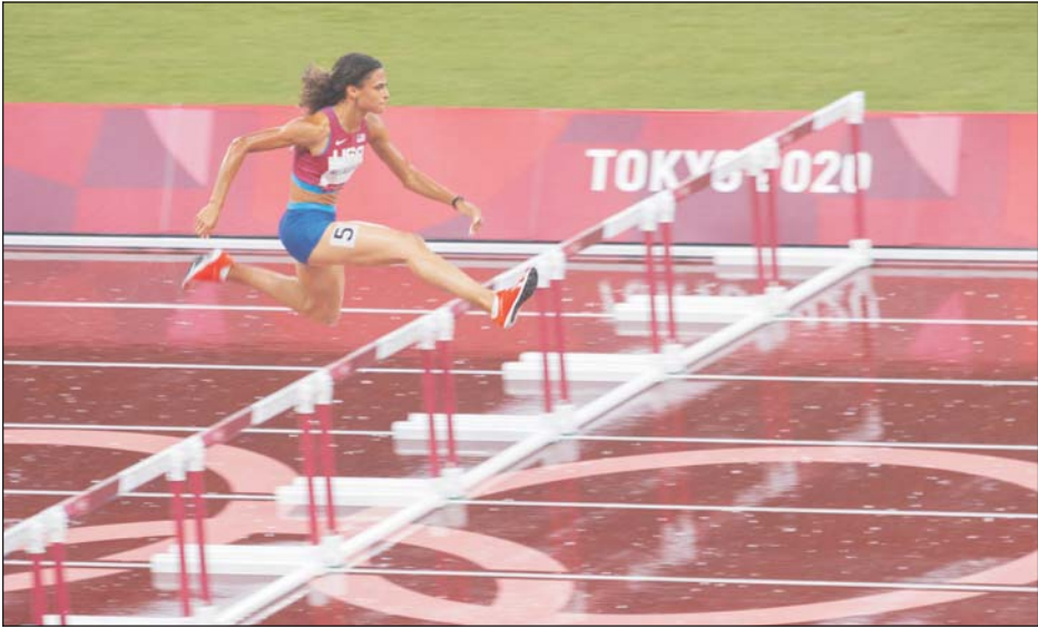
McLaughlin competing at the 400m hurdles semi-finals at the 2020 Olympic Games in Tokyo on August 2, 2021.

high school. McLaughlin then began to participate in national competitions with her eye on the 2016 Rio Olympics. She tried different length races during this period from 100-m to 600-m hurdles. She found that the 400-m hurdles were where she succeeded the most. In 2014, she received a silver medal at the 400-m hurdle race at the USA Track and Field Junior Championships. She also ran in the 400-m hurdle race at the 2015 World Youth Championships, where she received a gold medal for first place. In 2016, she competed in the 400-m hurdle race at the USA Track and Field Junior Championships, this time receiving a gold medal. In July 2016, McLaughlin was announced as the Gatorade National Female Athlete of the Year. Because of her record she was eligible to compete in the 2016 US Olympic Trials, where she would come in third for the 400-m hurdles, setting a new record for junior racers at 54.15 seconds. This placement brought her into the US team for the 2016 Rio Summer Olympics. At sixteen years old, she was the youngest member of the US track team since 1980. She participated in the 400-m hurdle race and came in sixteenth place with scoring.